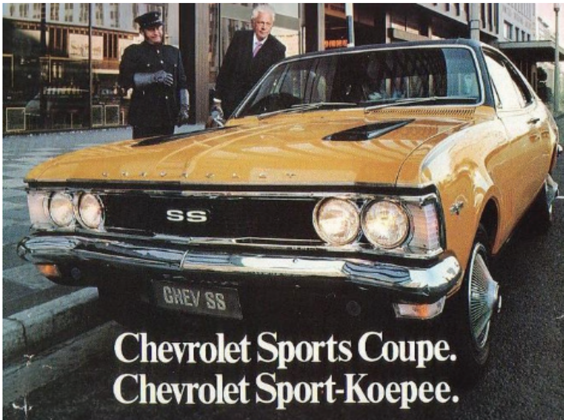
GM South Africa ad - a Monaro badged as a Chevrolet SS