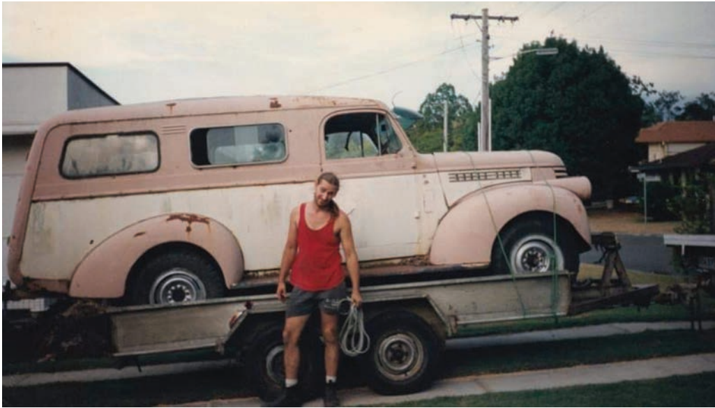
1998, moving to Brisbane from Toowoomba to start work on it. Me in the photo.