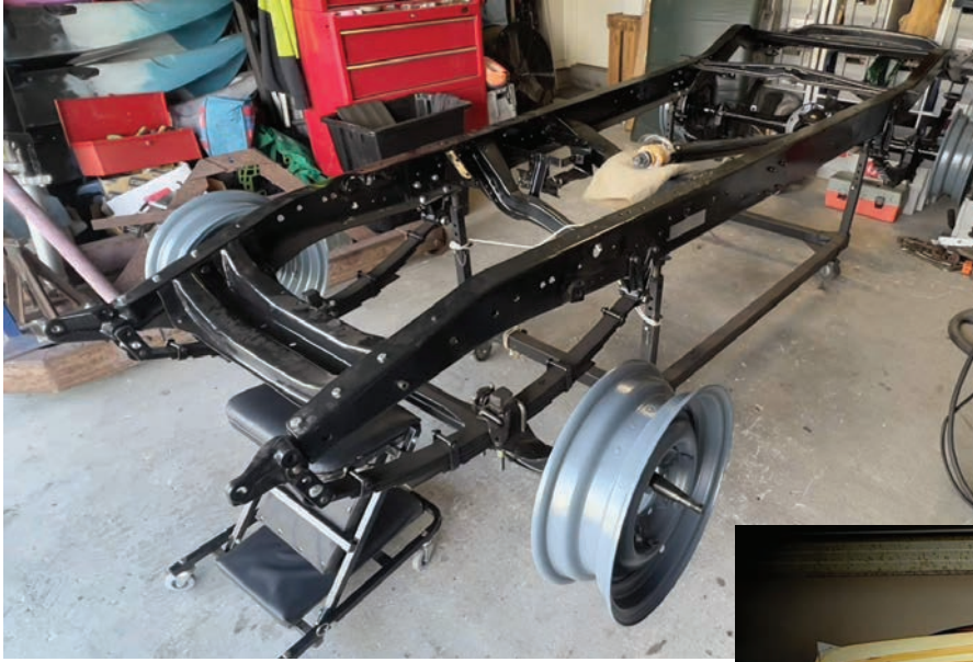
2023 rolling chassis