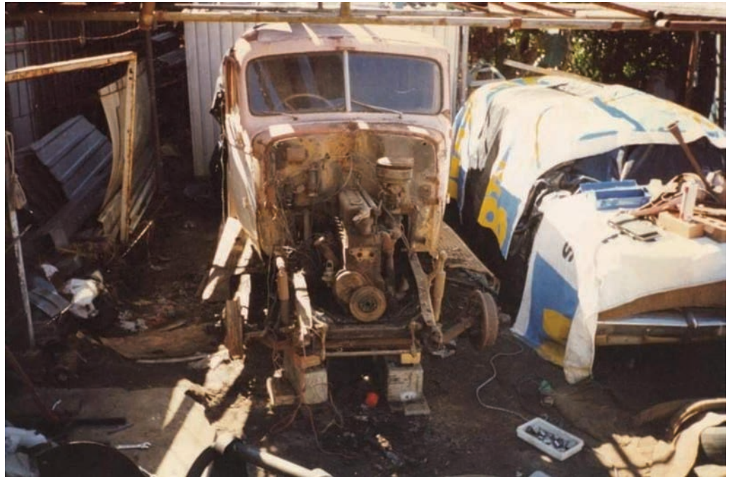
1998, let's start