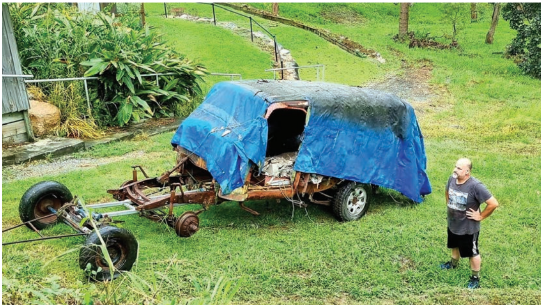
2021, Mum died suddenly, travel to Qld to retrieve Chev. between Covid outbreaks